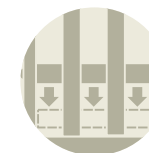
TWO BASE HEIGHTS