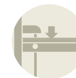
PROTECTIVE TEETHING RAILS