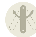
CROSS-PENDULUM ROCKING MECHANISM